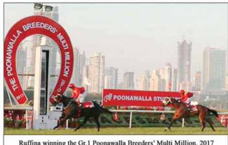
Ruffina winning the Gr.1 Poonawalla Breeders' Multi Million, 2017