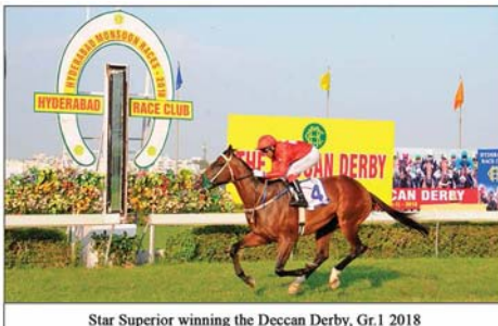
Star Superior winning the Deccan Derby, Gr.1 2018