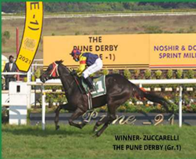
WINNER- ZUCCARELLI THE PUNE DERBY (Gr.1)

ROYAL WESTERN INDIA TURF CLUB, LTD PROSPECTUS PUNE MEETING 2022 22ND JULY 2022 TO 6TH NOVEMBER 2022