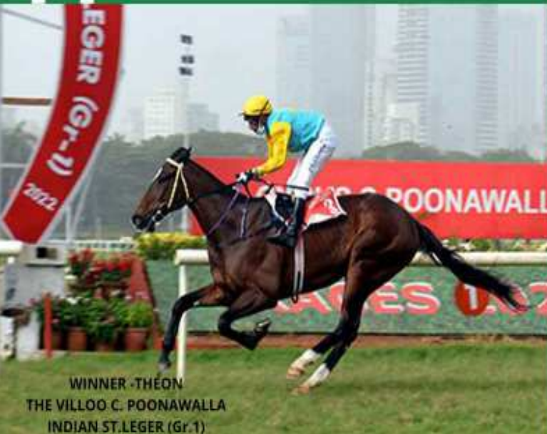
WINNER - THEON THE VILLOO C. POONAWALLA INDIAN ST. LEGER (Gr.1)